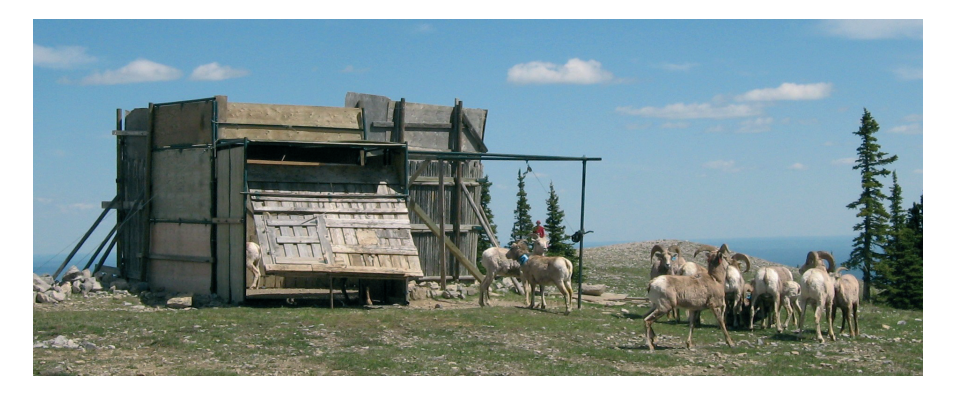
Fig 1. Corral trap baited with salt used to capture bighorn sheep at Ram Mountain, Alberta, Canada.

with salt (Figure 1; see methods and Réale et al. 2000 for details). Pedigree-based quantitative genetic analyses determined that both traits had an additive genetic basis and were negatively genetically correlated (Réale et al. 2009). The availability of detailed life history information for most individuals also provided links between personality and fitness components. For example, bold and docile ewes were found to reach sexual maturity before shy and aggressive ones (Réale et al. 2000). Boldness in ewes was also positively correlated with weaning success (Réale et al. 2000) and survival in years of high cougar (Puma concolor) predation (Réale and Festa-Bianchet 2003). In males, docility and boldness were found to have a positive effect on longevity, a weak negative effect on early life reproductive success, and a strong positive effect on late life reproductive success (Réale et al. 2009). Personality therefore appears to play important roles in the ecology and evolution of this species.